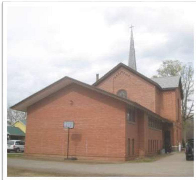
West Elevation with 1956 addition