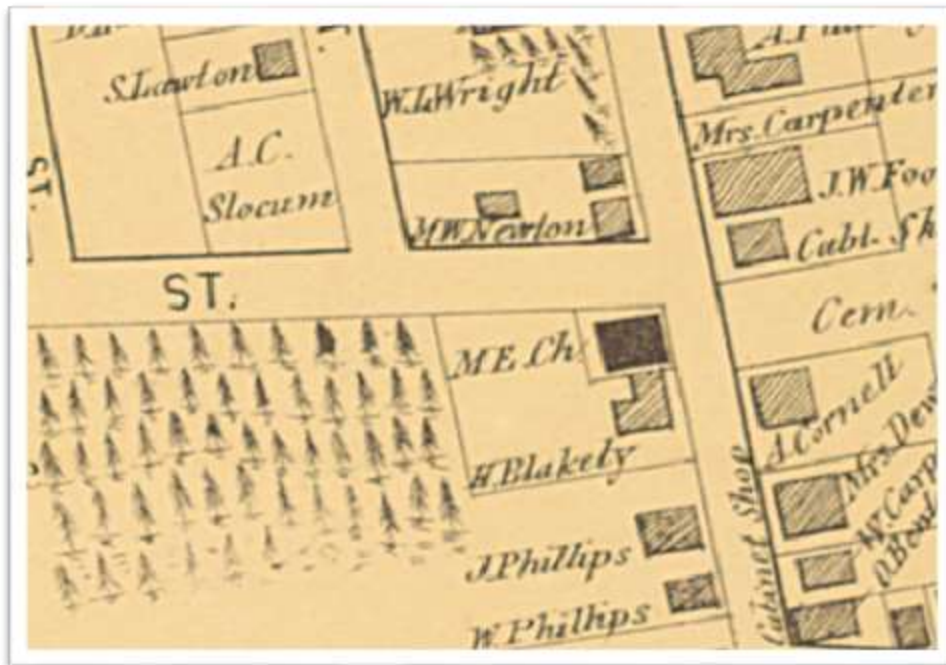
1860 Burr Map – show M.E. Church previously here