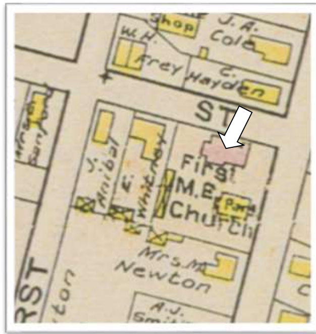
1905 Century Map – First M.E. Church