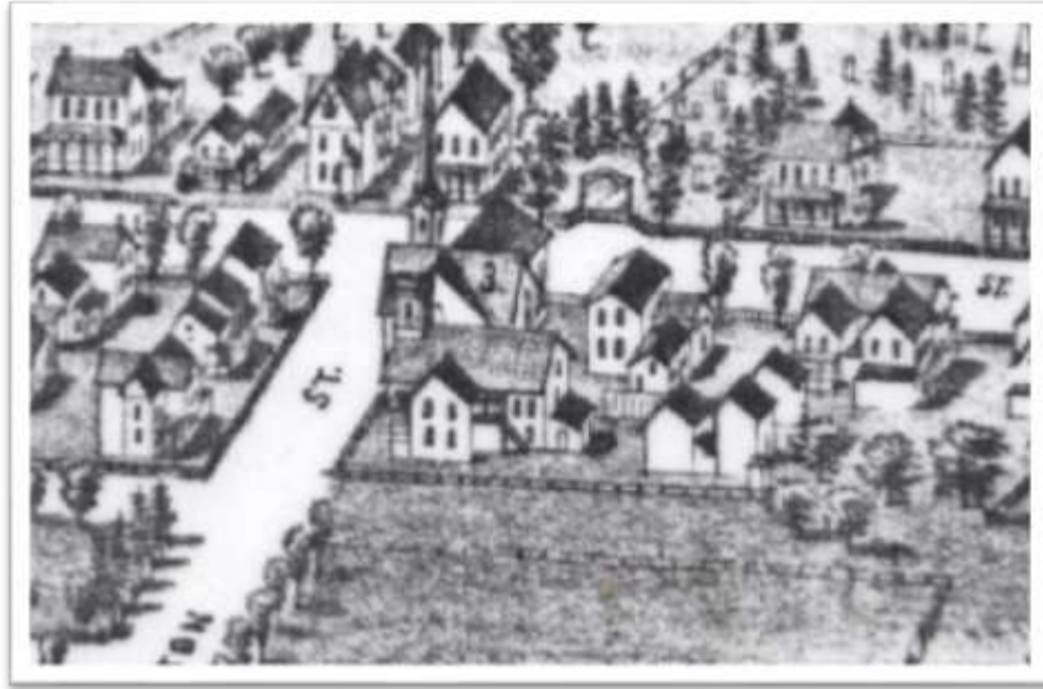
1890 Burleigh Lithograph - #3 New Methodist Church, the 1822 wood framed church in foreground