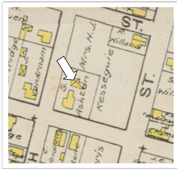
1905 Century Map - G. Ashton