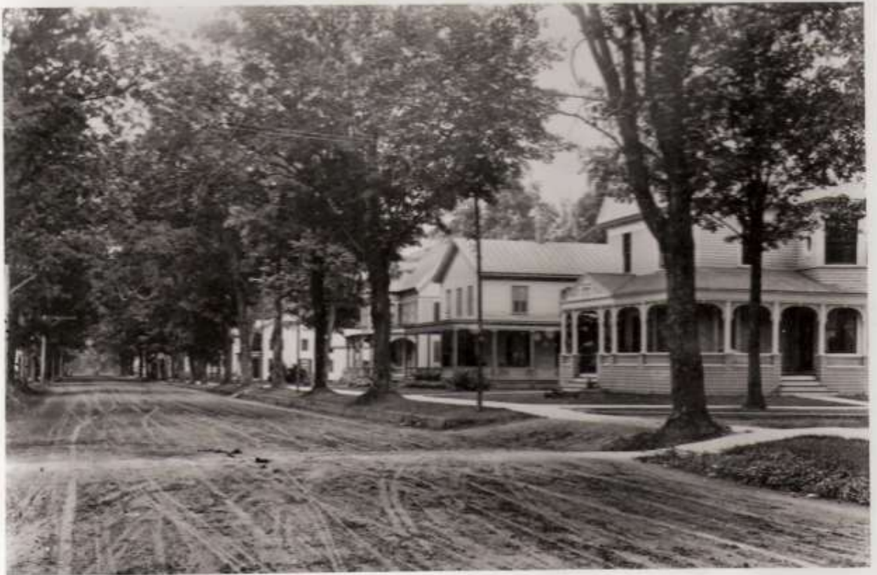
G.N. Brown House Built 1898 South Main Street