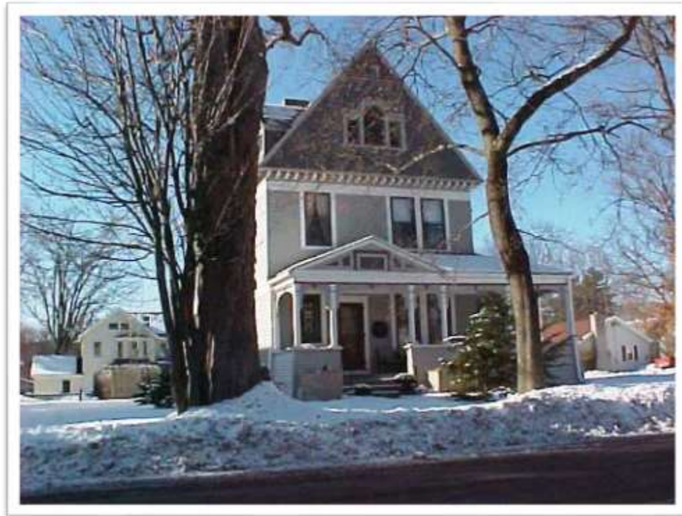
East Elevation (façade)