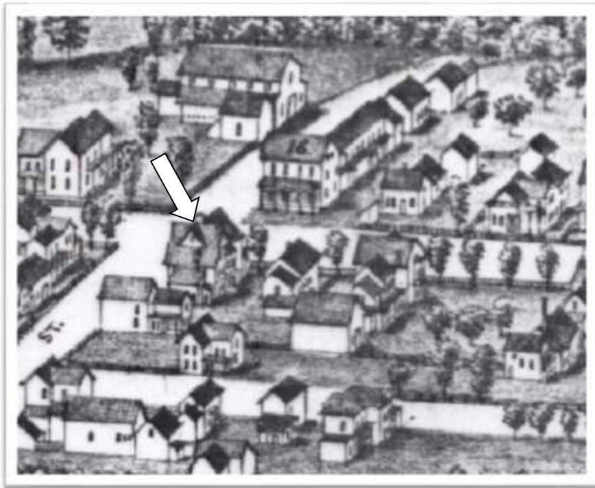
1890 Burleigh Lithograph – 201 S Main is located across from the Winney Hotel site.