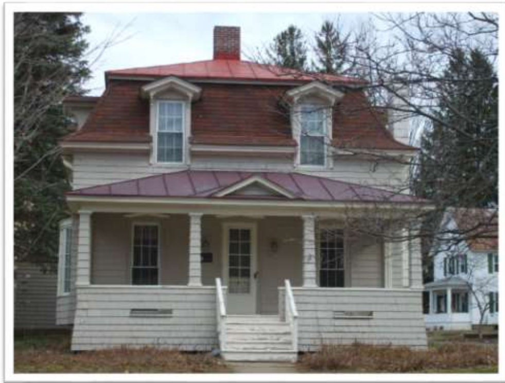
South Elevation (Façade)