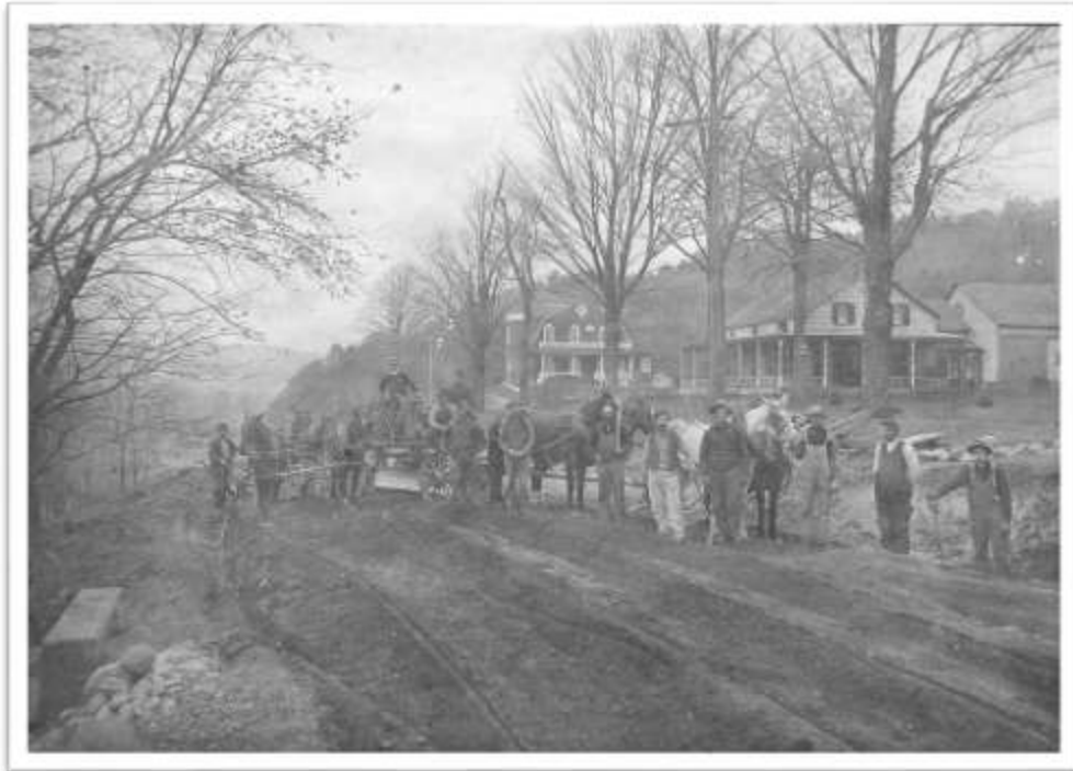
1912 Lamb's Hill and the road construction