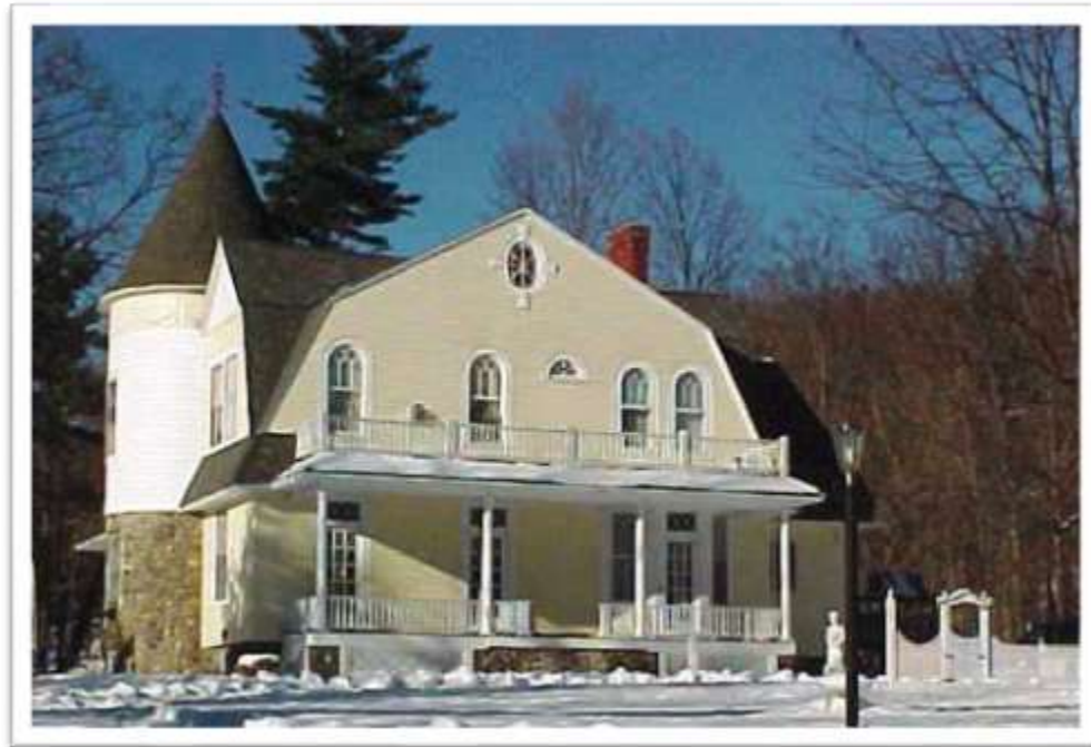
South Elevation – note replaced windows and removal of enclosure.