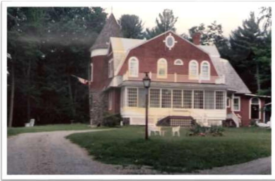
South Elevation in 1980's