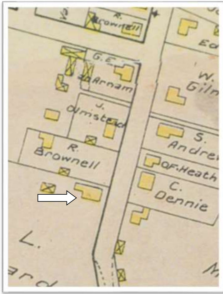
1905 Century Map – G.L. Howard is location of 541 S. Main