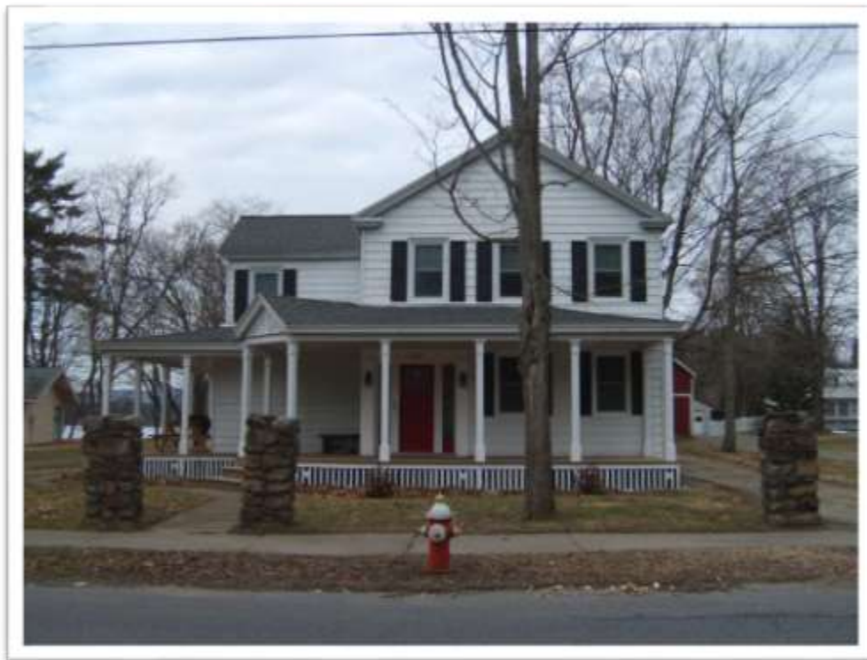
East Elevation (Façade)