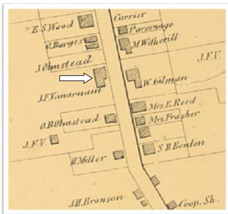
1860 Burr Map – J.F. Vanarnum