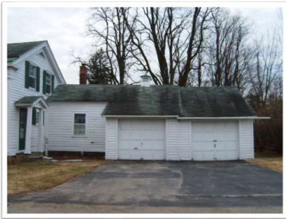
North elevation with rear garage addition