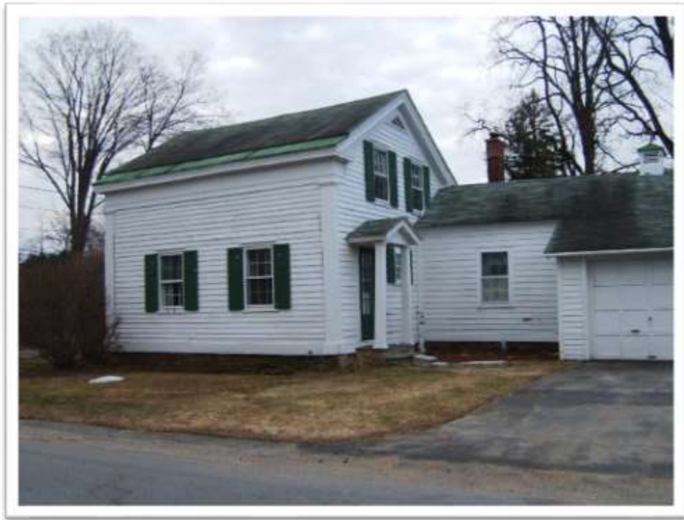
North Elevation taken from VanArnum Rd.