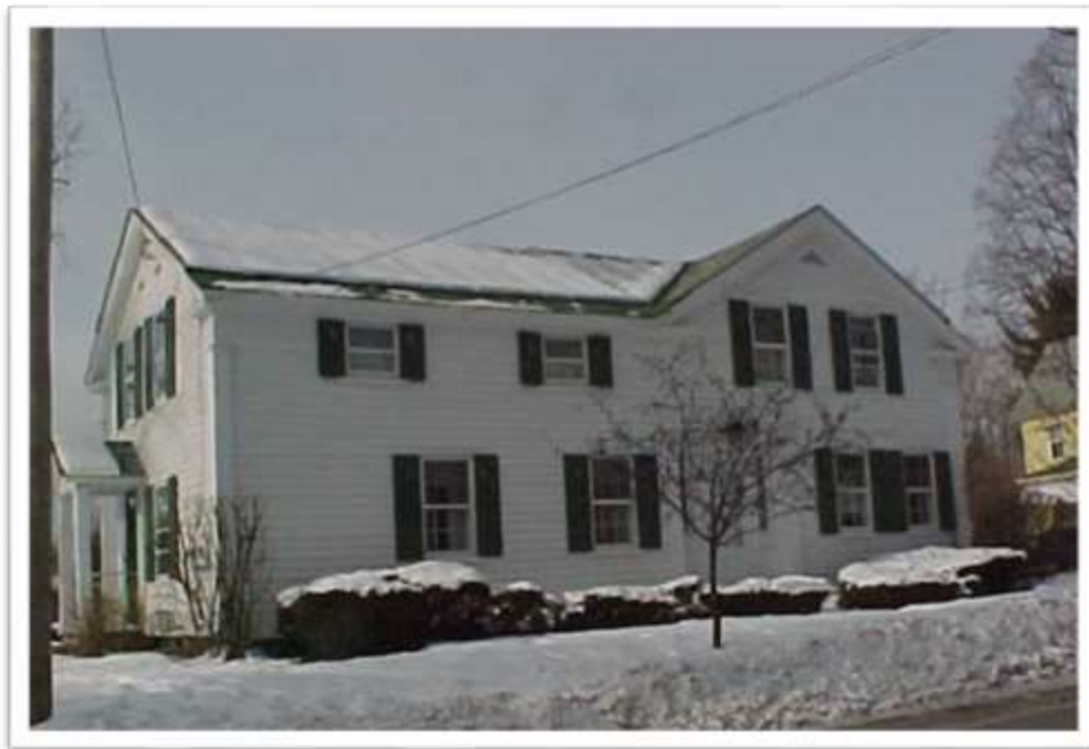
East Elevation (Façade) taken from S. Main