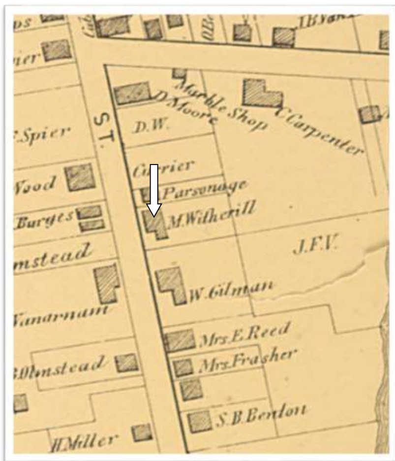
1866 Burr Map