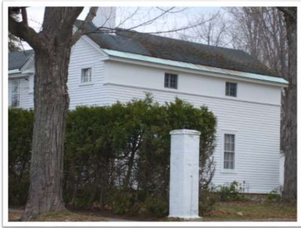
South end of the house (addition)