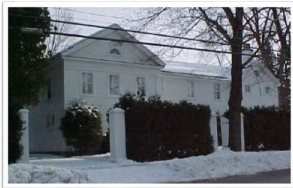
West Elevation (façade) original house is pictured on the left side.