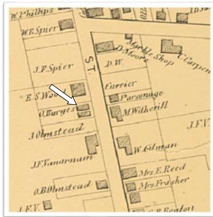
1860 Burr Map – O. Burges