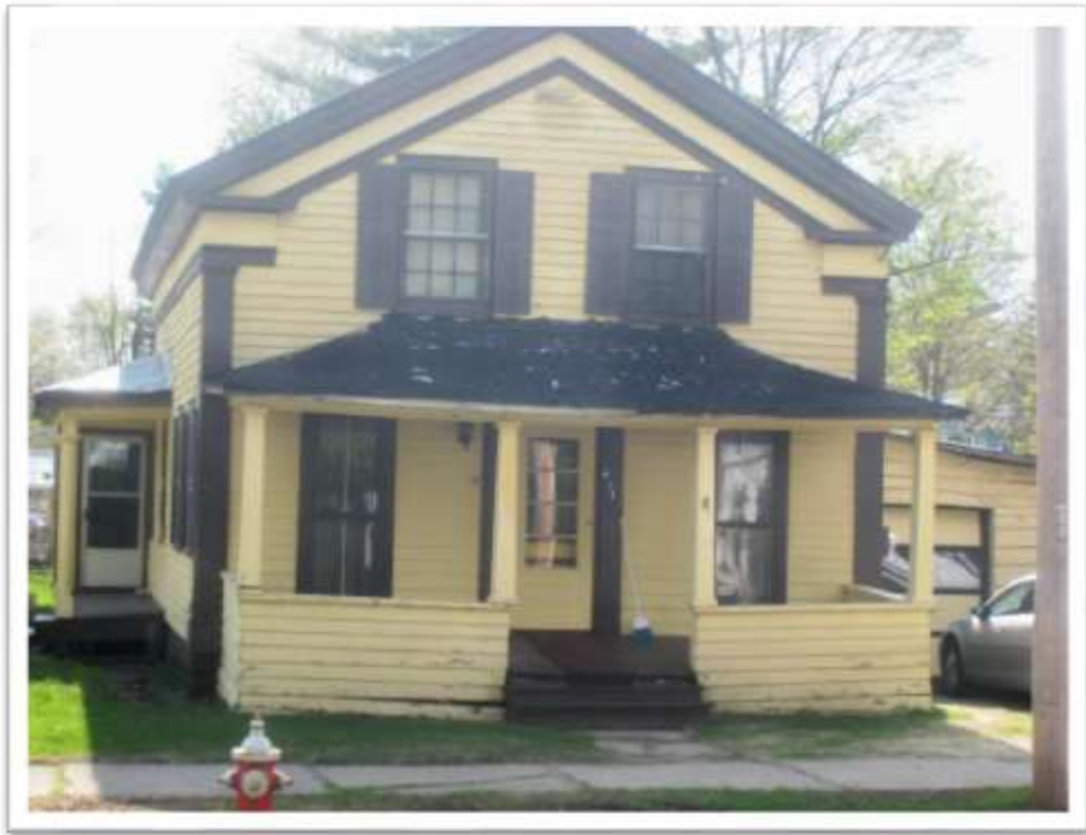
East Elevation (façade)