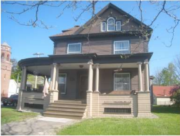
South side Front

421 Bridge Street, Colonial Revival, Taken May 12, 2009 by Warren Taylor