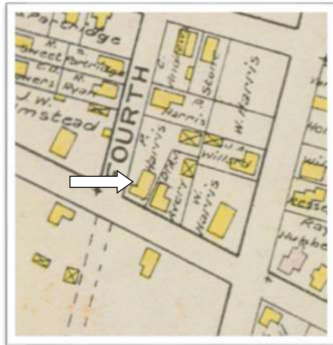
1905 New Century Map – “P. Harris”