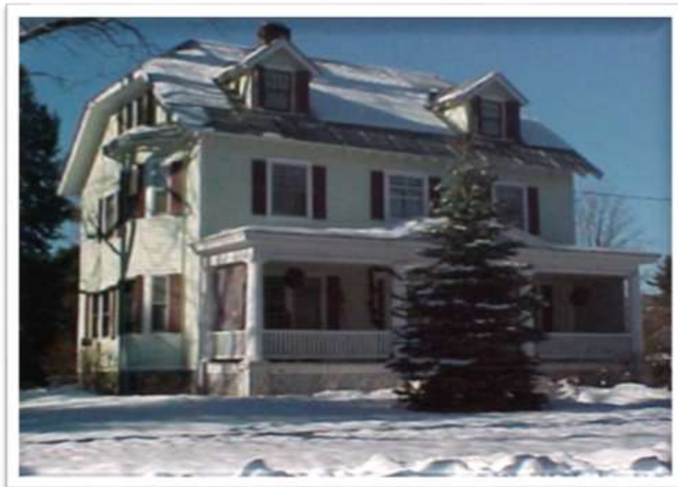
East Elevation (façade)