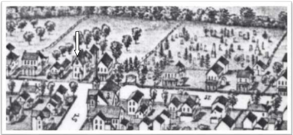
1890 Burleigh Lithograph