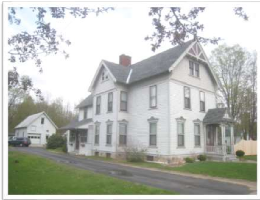
North Elevation and rear garage.