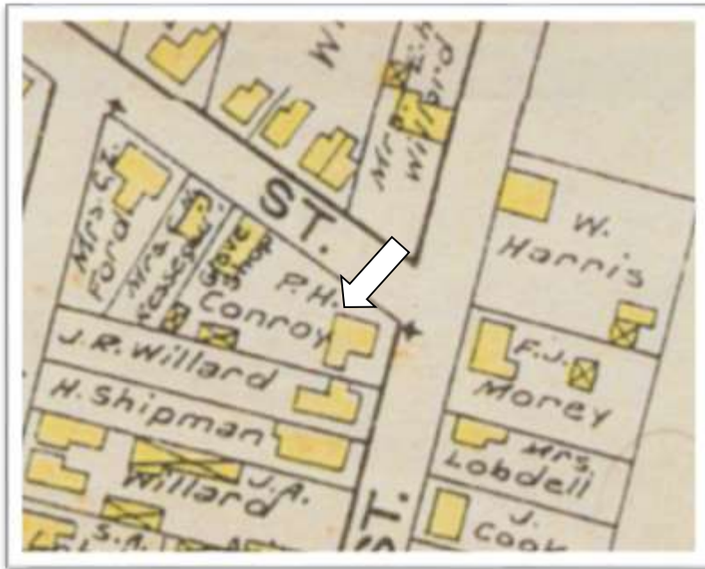
1905 Century Map – P.H. Conroy