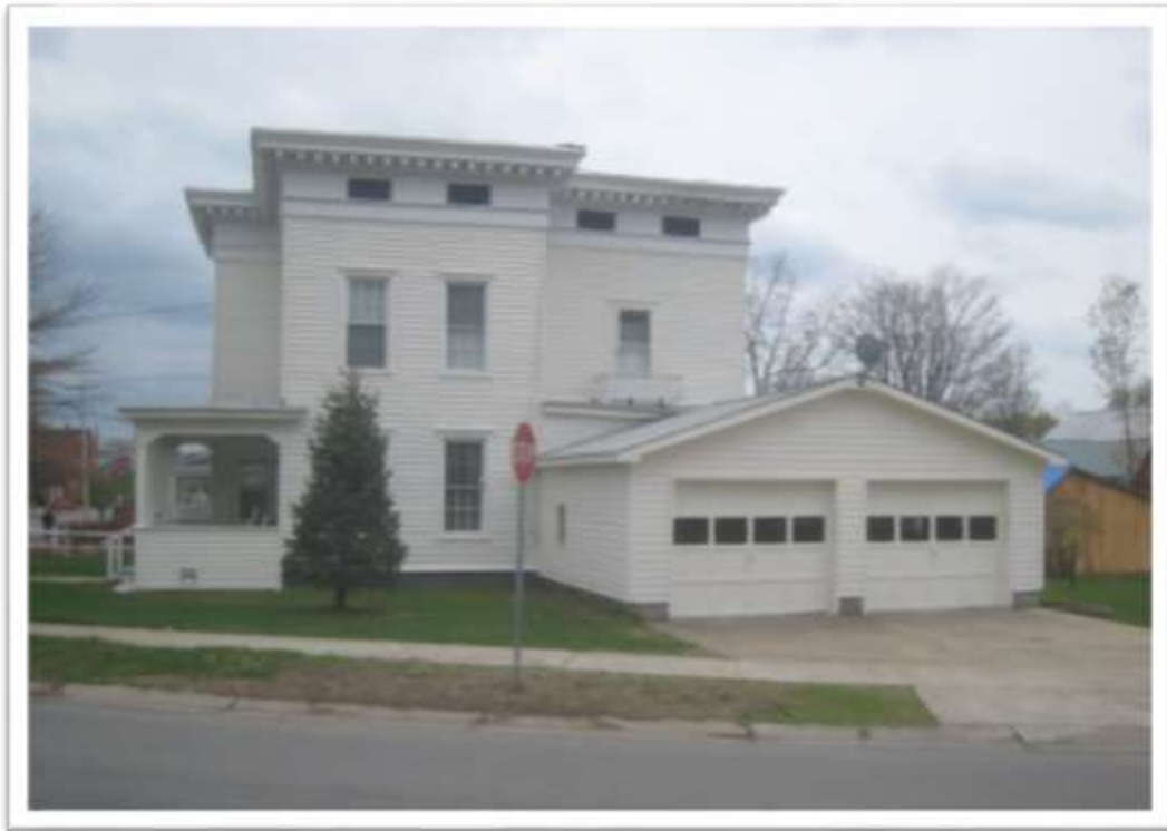
North Elevation with newer garage addition