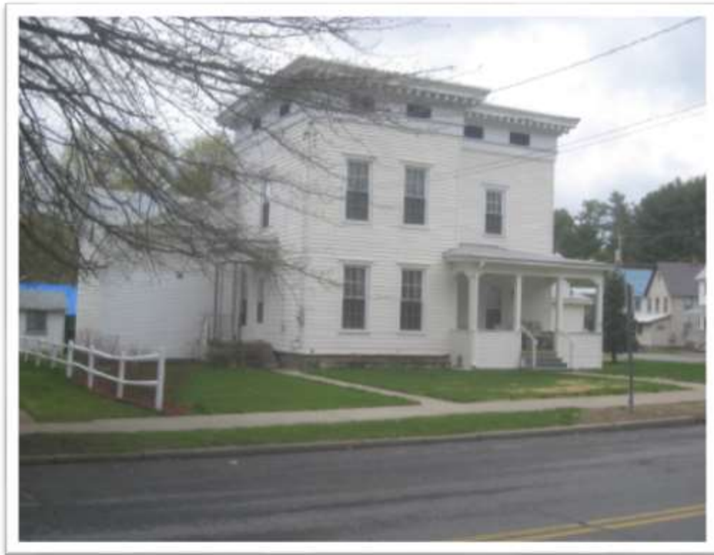
East Elevation (Façade)