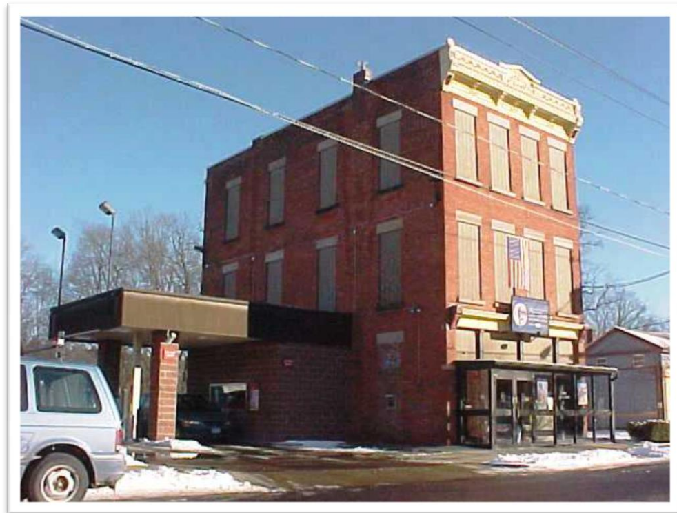
West (façade) and North elevations