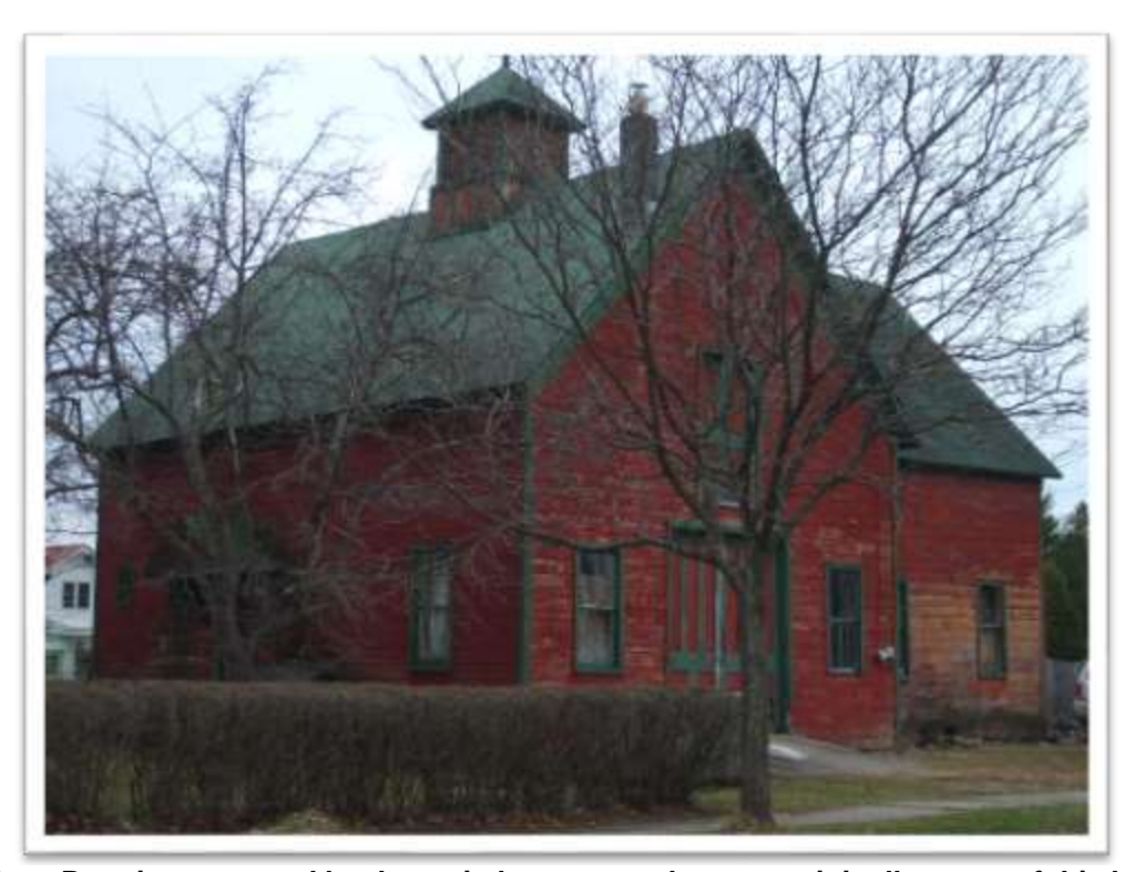
Carriage Barn is not owned by the main house now, but was originally a part of this home.