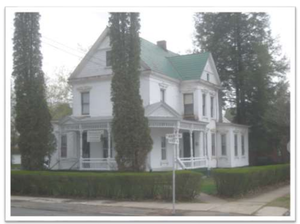
East Elevation (façade)