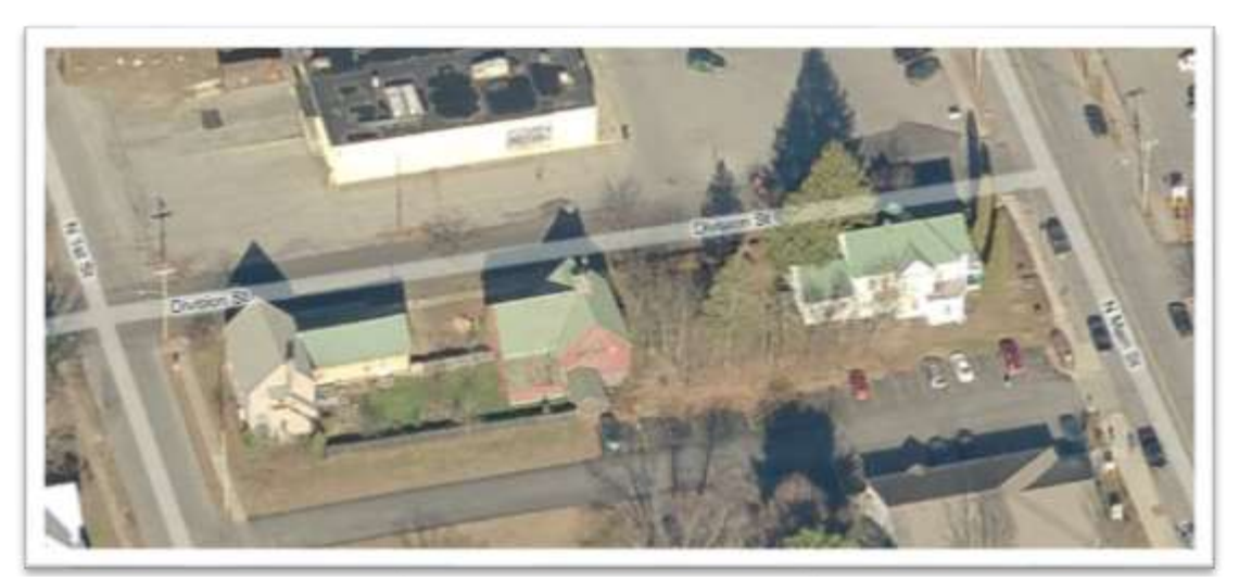
Bird's eye view - Bing maps