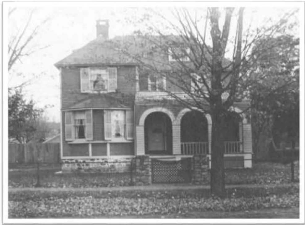
Circa 1900 Photo