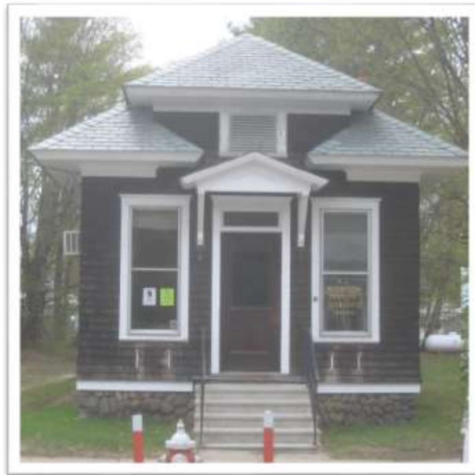
East Elevation (façade)