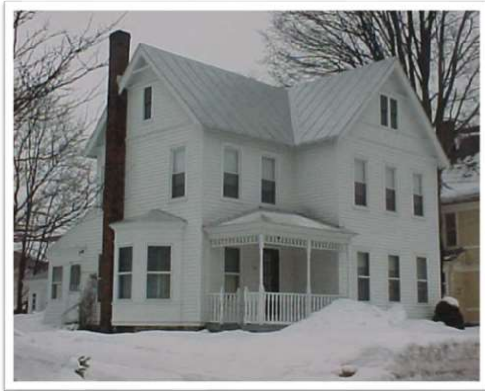
East Elevation (façade)