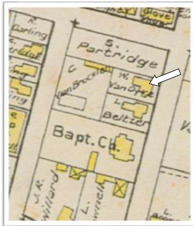
1905 New Century Map – "W. VanDyke"