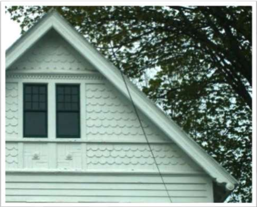
Detailing typical of Northville architecture