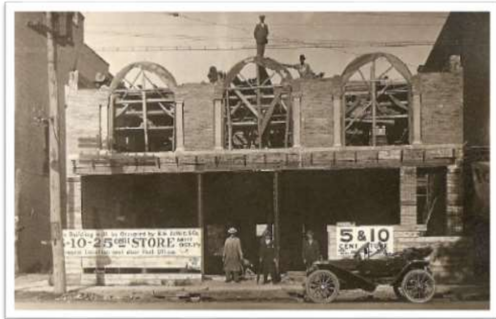
Building the DeWitt in 1914