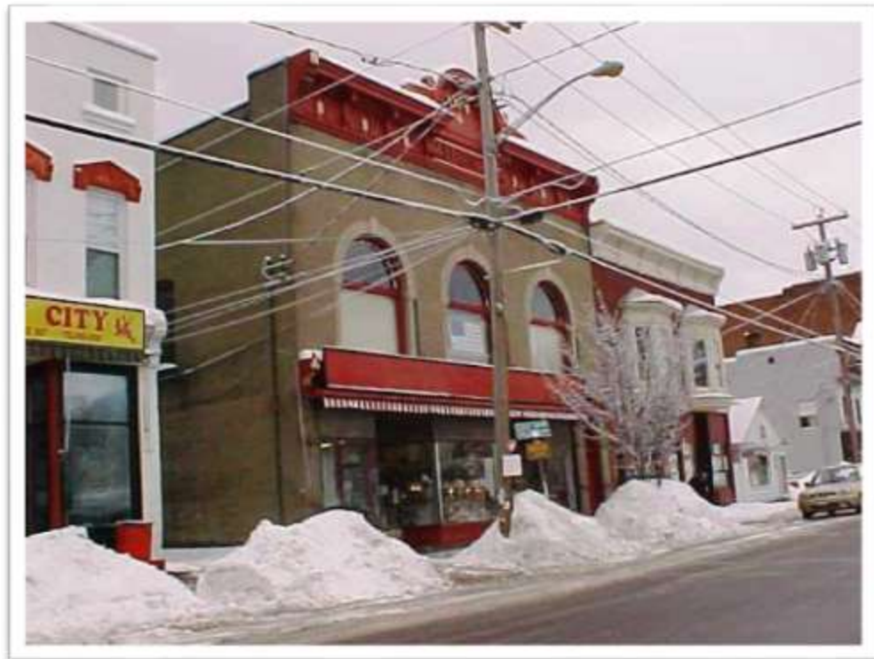
West Elevation (façade)