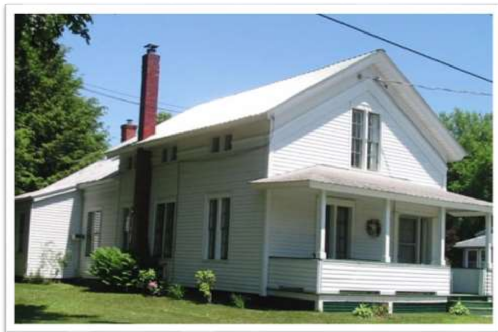
West and South (façade) Elevation