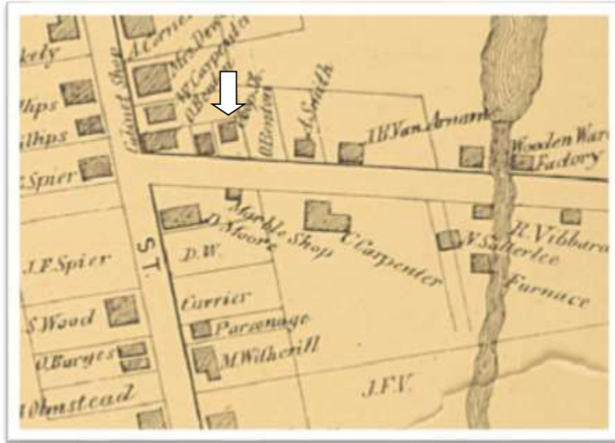
1860 Burr Map – “Coop Sh.” for Cooper Shop (barrel maker)