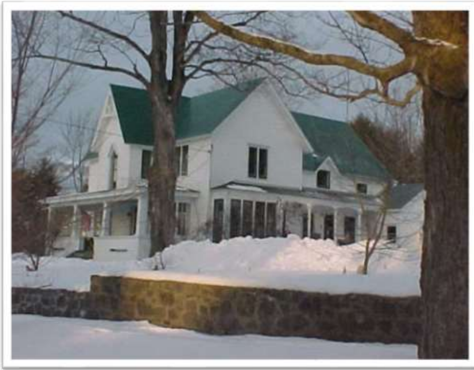
South and east elevations – note stone walls are a feature of this property