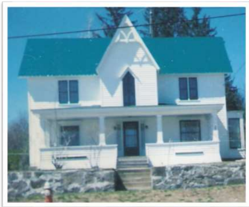
South Elevation (façade)