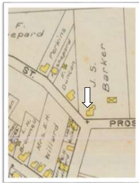
1905 New Century Map – J.S. Barker