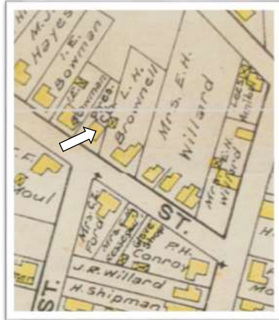
1905 Century Map – Pres. Ch