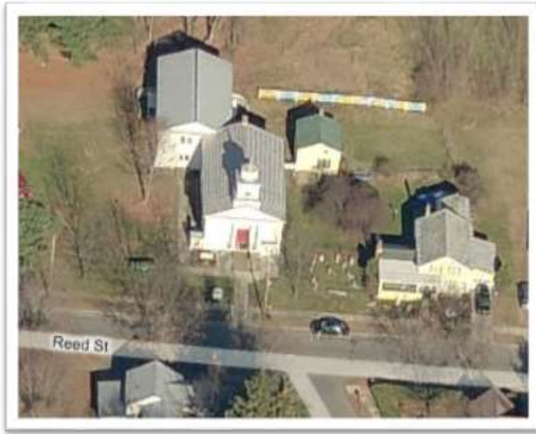
Bird's eye view - Bing Map