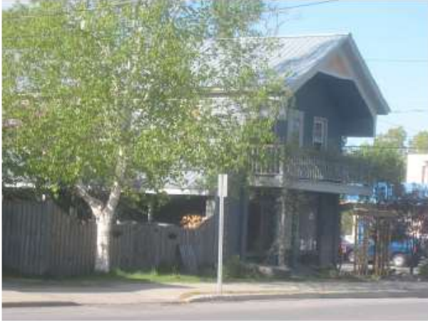
East side Front