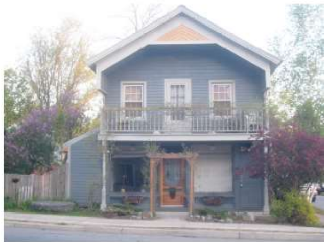
North side - Front