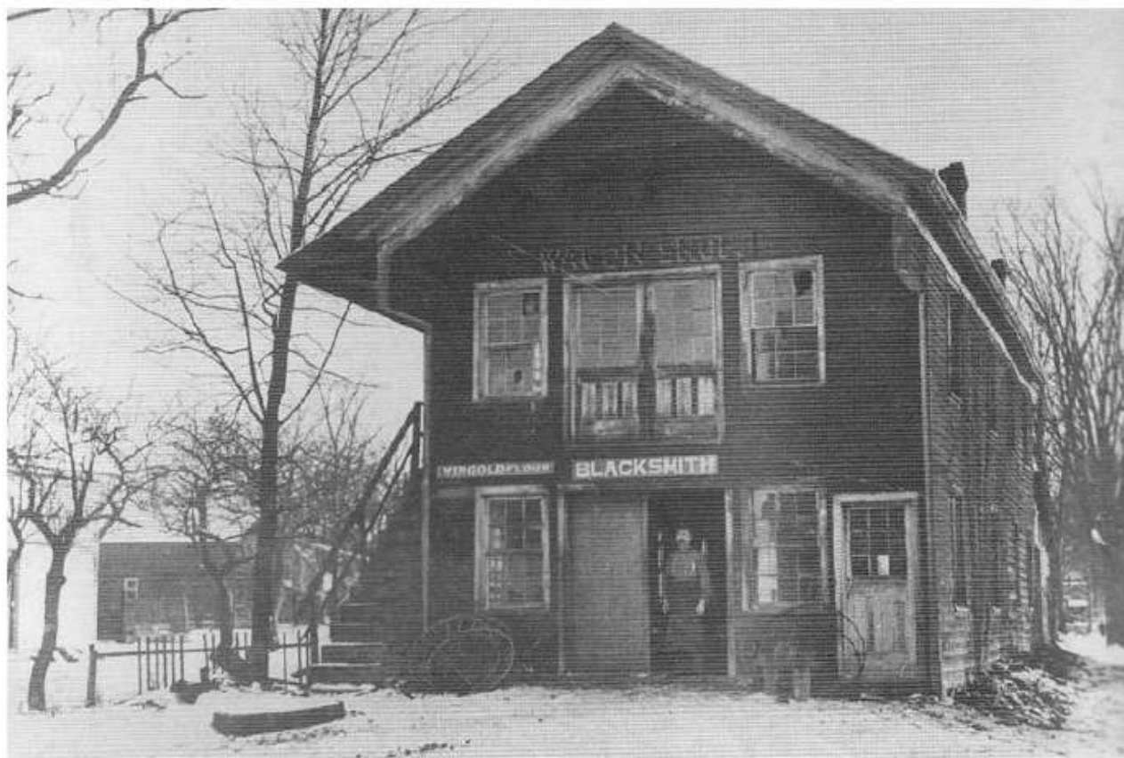
Cam Chequer stands in the doorway of the Blacksmith Shop c. 1900