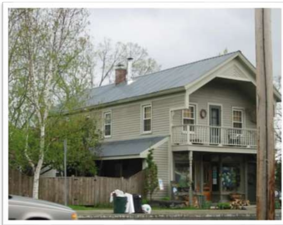
North elevation (façade) 2006