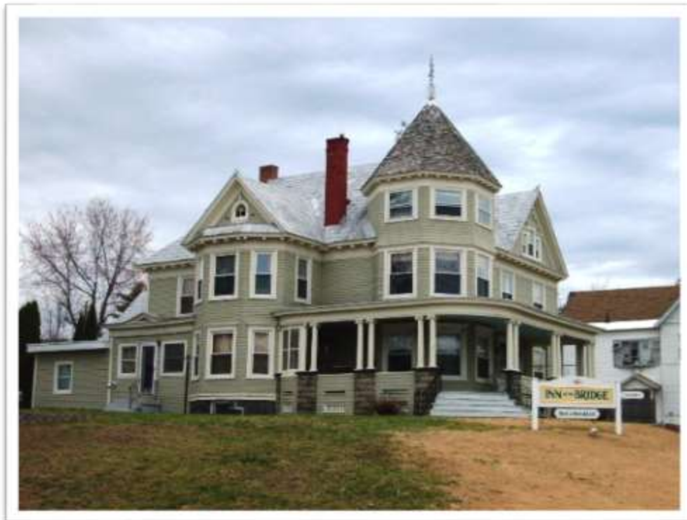
John Willard House, West Elevation