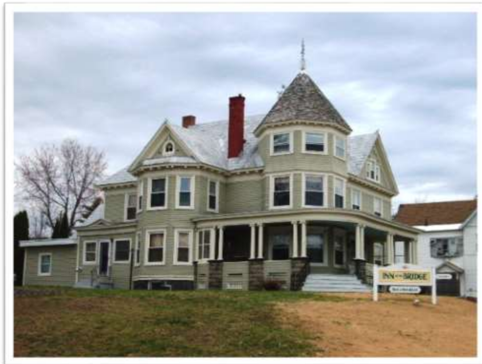
John Willard House, West Elevation