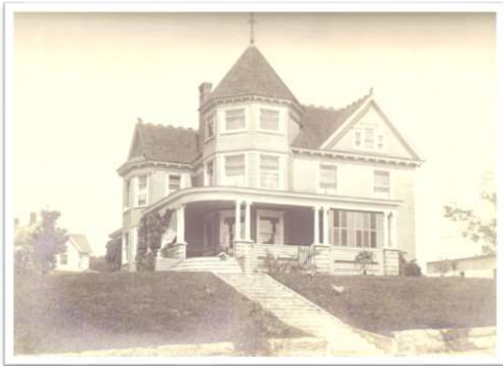
Taken between 1903-1929, South Elevation (Façade) Note long stairs and wall